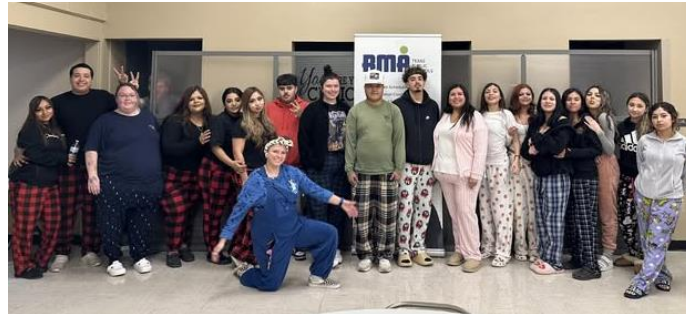
Midland Spirit Week