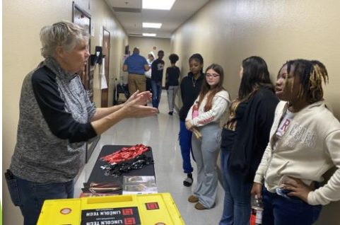
Fort Worth's Career Fair