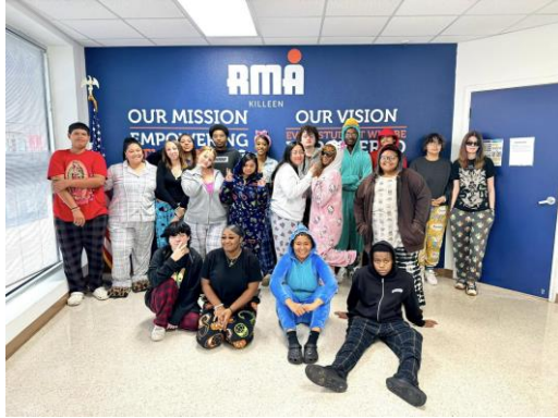
Killeen Spirit Week