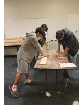
Odessa NCCER students working on their project