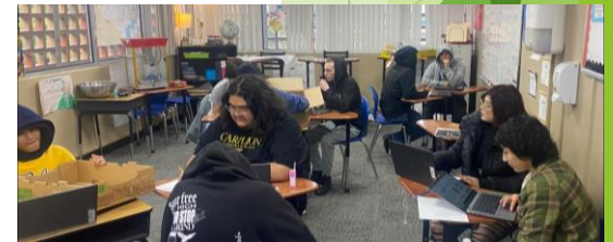
Lubbock Construction Drawing