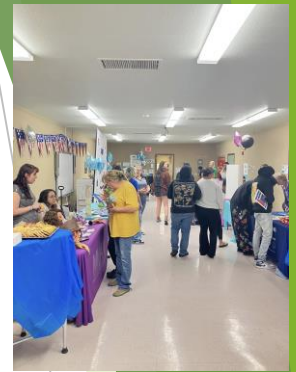
Amarillo's Career Fair